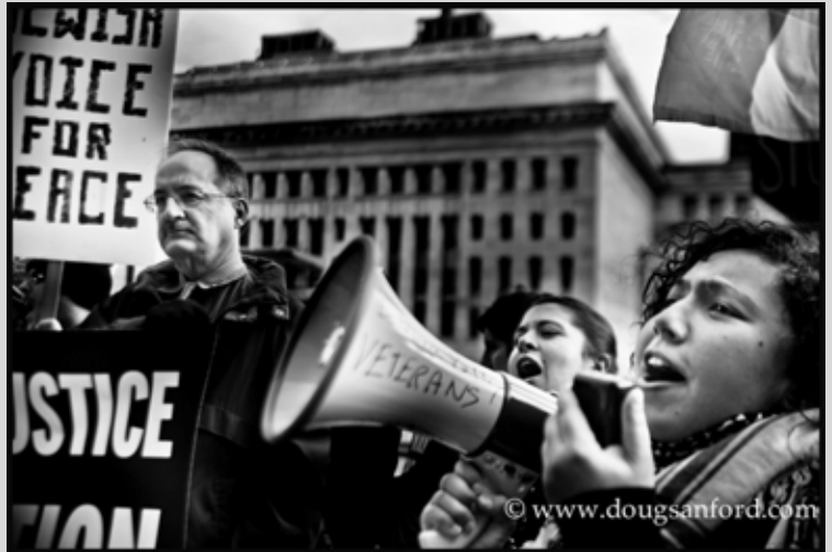
The Grassroots Advocacy Training provided seasoned organizers and new activists with skills and experience, and the Expose AIPAC mobilization put those skills to use immediately! These photos capture the symbolism and power of the actions held in front of the Washington DC Convention Center where AIPAC held its annual convention on March 3 and 4, 2013 (photos by Doug Sanford; except lower left photo by anonmedia).